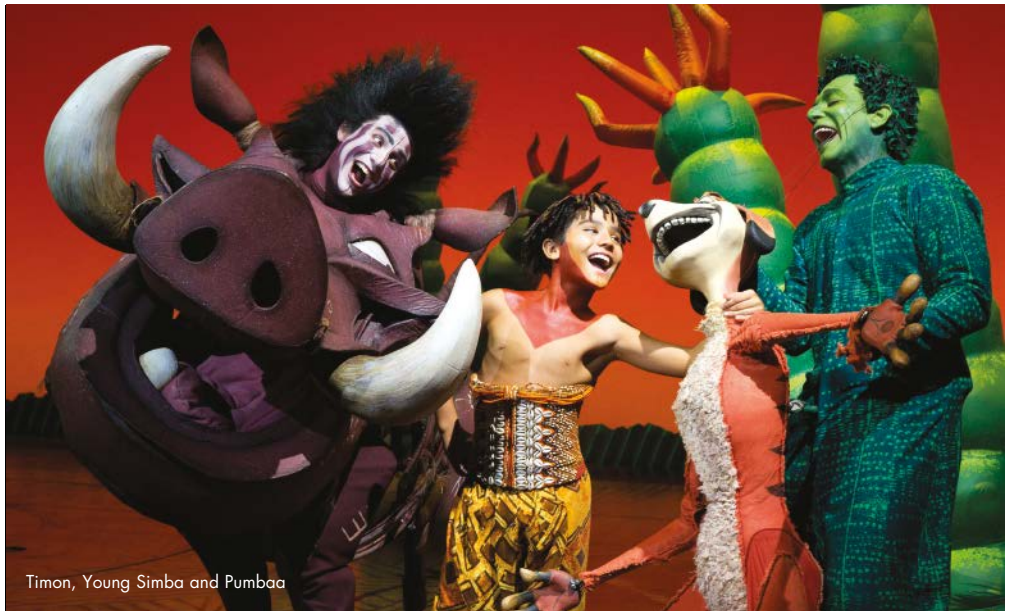
Timon, Young Simba and Pumbaa